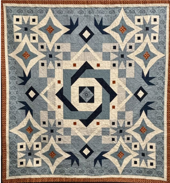
"Blue Indigo" Raffle Quilt